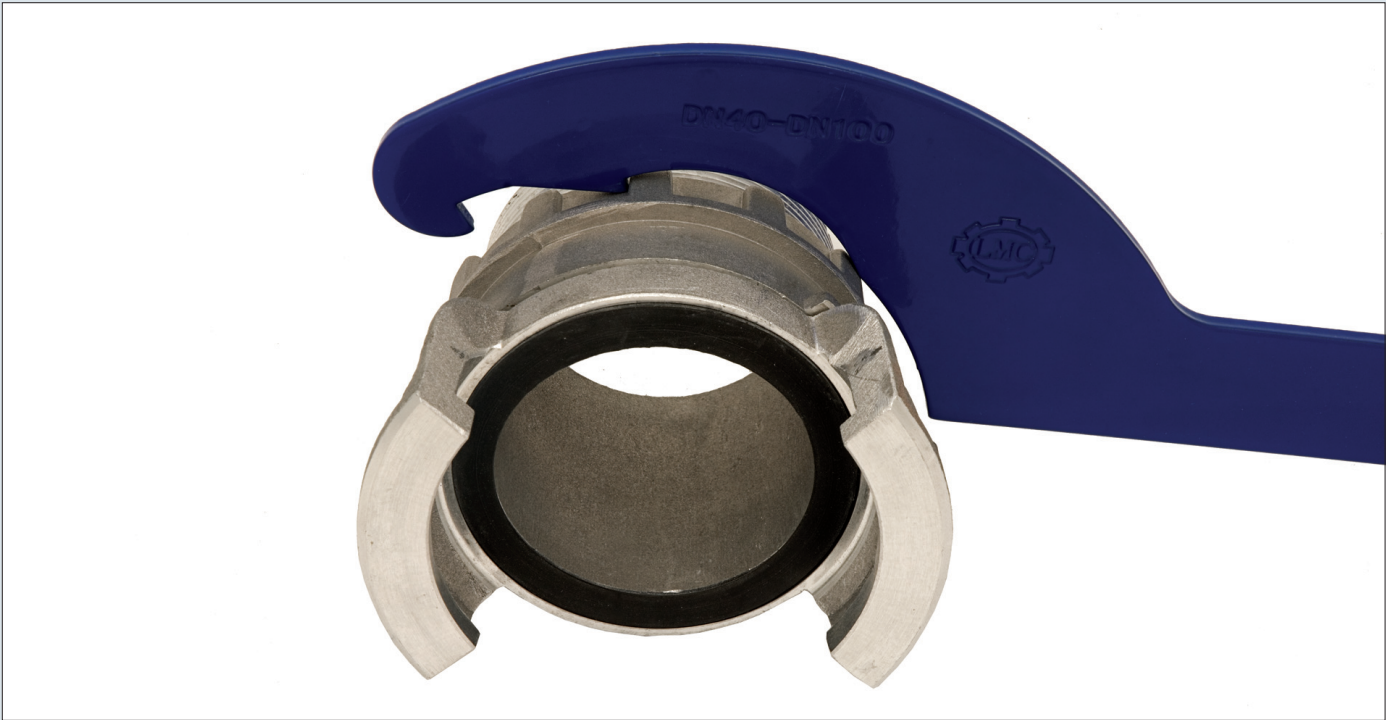
Multi wrench GY®

N.B.: LMC’s DSP couplings are not interchangeable with LMC’s Guillemin couplings.